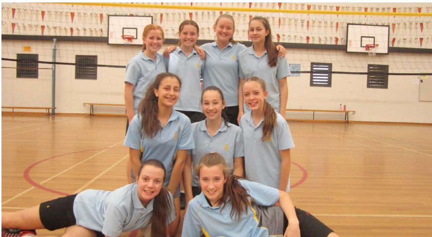
Congratulations to the Year 8 Girls Volleyball Team. They came runners up in the Beachside, Girls A Grade, Volleyball competition.

The Year 8 Girls Tennis Teams had a fantastic day out at Dendy Park, with both A & B teams coming away unbeaten. Congratulations to all of the girls, they were fantastic sports and well deserved winners!