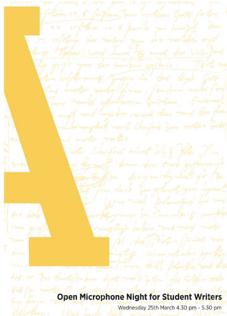
Open Microphone Night for Student Writers Wednesday 25th March 4.30 pm - 5.30 pm

This evening, Wednesday 25th March at 4.30pm Albert Park College will host its first official Open Mic Night for APC Student Writers. Student Writers will present their stories, poems, prose and non-fiction pieces to each other, teachers, parents and carers.